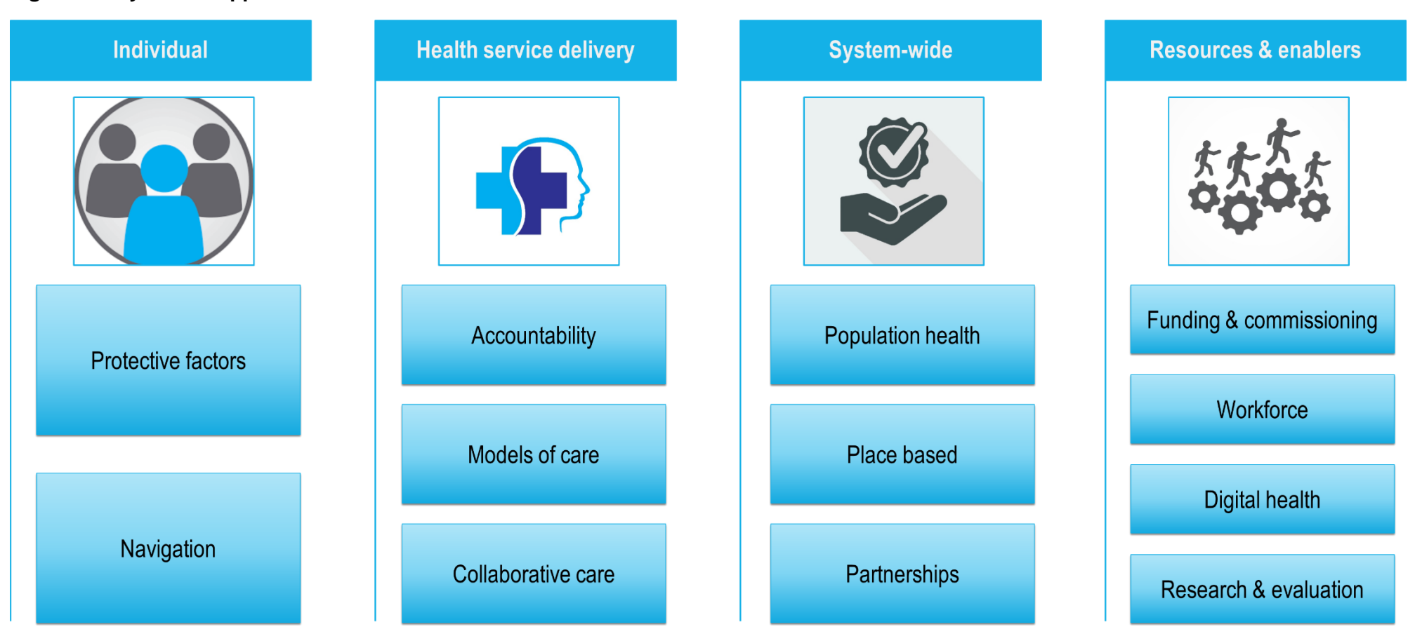
Figure 2: Key reform opportunities

Each reform opportunity is outlined, with specific strategic action areas identified.